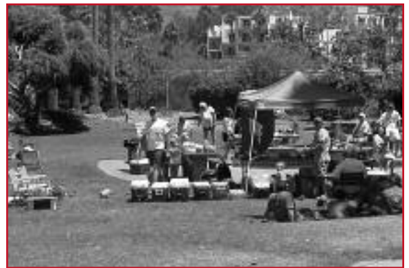
Scenes from last year's Beach Party.