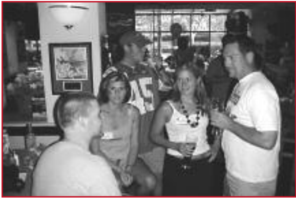
Friends and Buckeyes at the National.