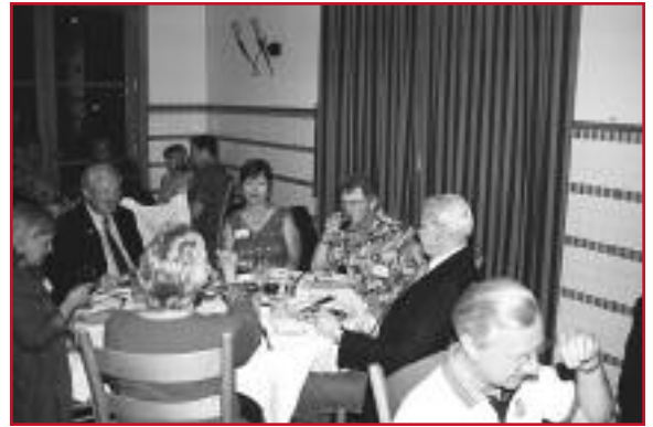
A great night of food and wine.

Our “OSU: Under the Tuscan Sun” wine tasting dinner at Il Fornaio in Irvine was a wonderful event! We had 39 Buckeyes in attendance. Our private room setting was perfect as we sipped on Italian wines starting with a lovely sparkling wine and appetizers. Buckeyes mixed and mingled as we anticipated our special menu dinner selection and accompanying wine tastings! Il Fornaio’s wine sommelier described in detail the Italian wine we tasted, the region and the importance of each selection. Each wine tasting was specially paired with our menu selections of appetizers, salad, main course and dessert. We ended our evening with a lovely port wine and most delicious tiramisu dessert! The best part was the opportunity to dine with our fellow Buckeye OC alumni, and have a great evening! We celebrated our excellent NFL draft recruiting successes and shared our Buckeye pride and stories of OSU amongst our group while dining together. We hope to make this an annual event for our club! Pictures from our event can also be seen on our website at: www.osuocie.org