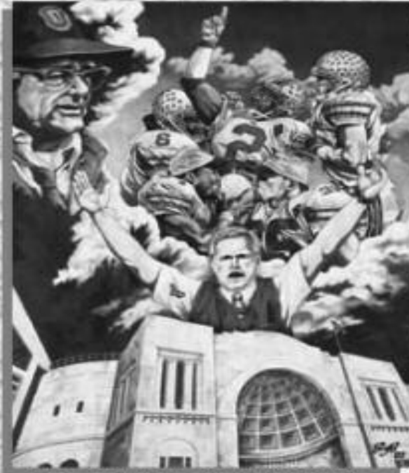
THE NATIONAL CHAMPIONSHIP